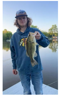
Martin Lake Fishing